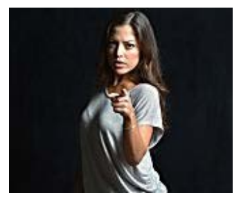
Ever Googled Yourself? Do A "Deep Search" Instead BeenVerified Subscription