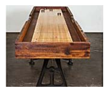
Thinking Of Buying A New Couch? Go To This Site First Wayfair