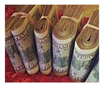
Brilliant Mortgage Payoff Method Has Banks On Edge Comparisons.org