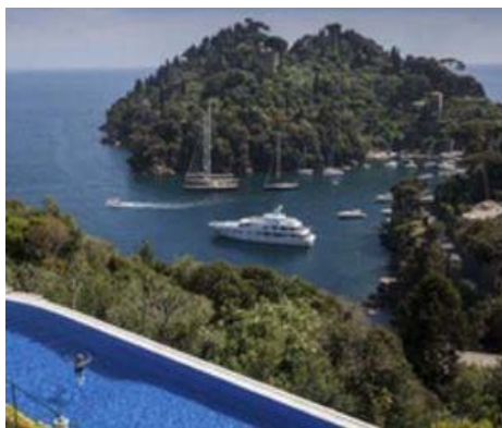
The Hotel Splendido pool overlooks the harbor in Portofino, Italy. Browse for Republican American Reprints

But the next morning, as we sailed closer, a gentle hill appeared on the horizon with an ancient tower and walled harbor along the shore. Red-tiled mansions lined the water's edge where private yachts and fishing boats rode at anchor. Miniature cottages climbed the hill, half hidden among groves of trees. Elba wasn't a prison at all.