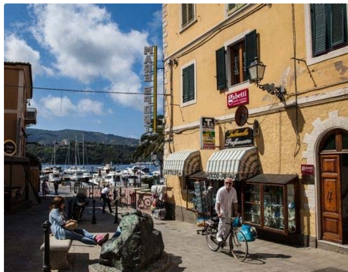
Tribune News Service | Life moves slowly on the cobblestone streets of Porto Azzurro, island of Elba.