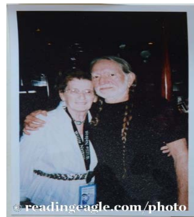
Daily photos from 12/30/2015

Students and bargain hunters bought inside staterooms on D Deck, sometimes called third class;