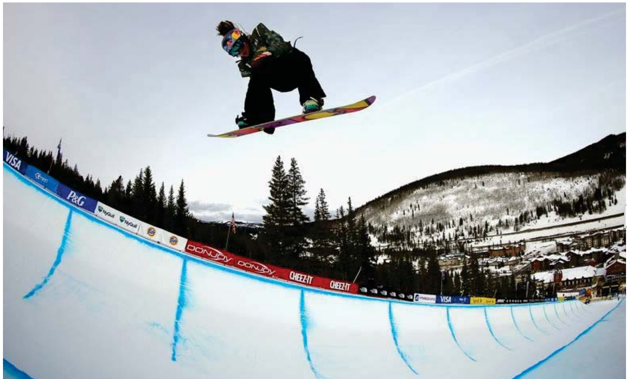
A halfpipe: something snowboarders leap about on, not something they smoke.

Originally published November 13, 2015 at 6:06 am Updated November 13, 2015 at 11:30 am