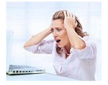
You've Got Better Things to Do than Data Entry Neatology by Neat