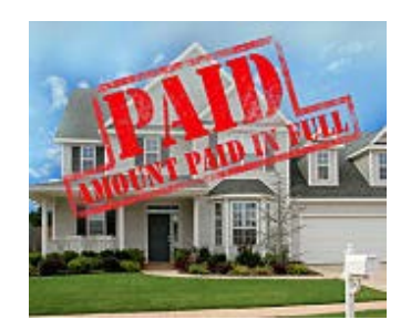
Homeowners Are In For A Big Surprise In 2016 LowerMyBills