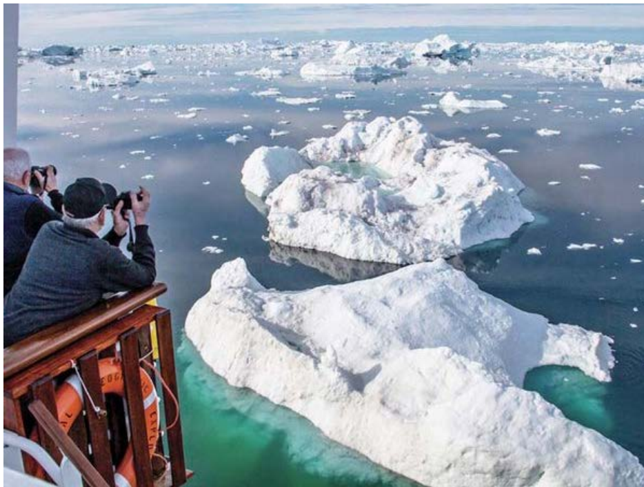
Weaving among icebergs on the approach to Ilulissat, pop. 4,453, Greenland's third largest village.

Share 1 | Tweet 85 | Reddit 0 | Email 1 | 1 COMMENT