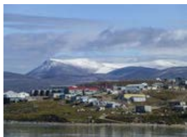
GALLERY: Chancy dance with icebergs on High Arctic cruise