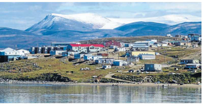
Pond Inlet, population 5500, is an Inuit village established by the Canadian nent on Baffin Island

Anne Z Cooke discovers that even the best-planned expedition can't account for nature