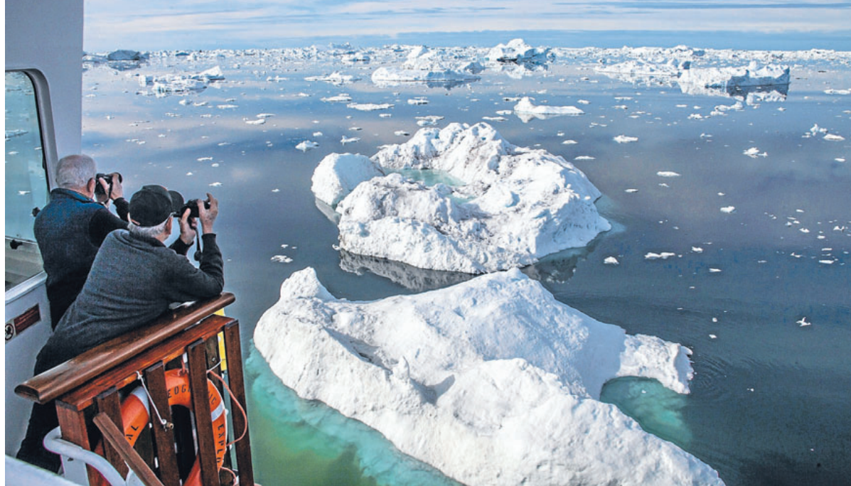
Weaving among icebergs on the approach to Ilulissat, Greenland's third largest village.

ambled towards the ship, her two nearly grown cubs in tow