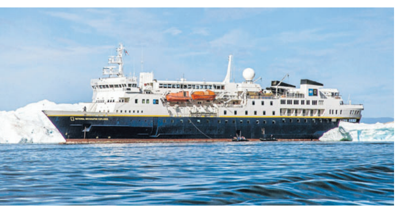
The Lindblad Expedition National Geographic Explorer anchors among the icebergs at Ilulissat, Greenland.