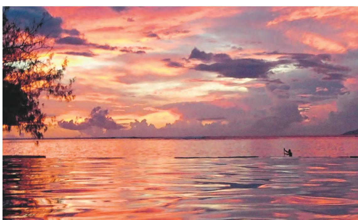
A distant paddler, silhouetted against a fiery sky, becomes part of the story in Papeete, Tahiti.

And there's another plus. Because Tikehau is self-sufficient (the resort's "green" technology includes a desalinization plant, solar panels and refuse disposal tanks periodically shipped to treatment plants on Tahiti) your wedding will leave no footprints. But it will surely be the year's most memorable.