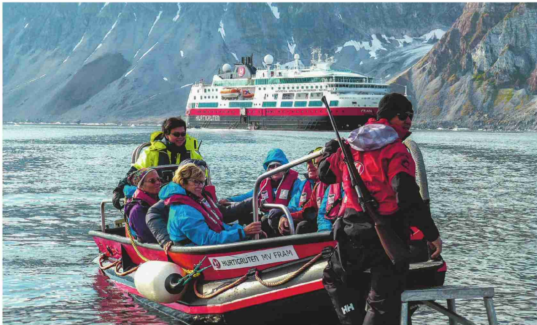
LEFT: Passengers come ashore in Burgerbukta Bay, with the MS Fram in background.