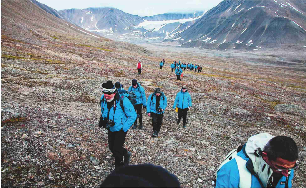
ABOVE: It's a long, rocky trail that ascends the ridge on Nordaustlandet Island as passengers from the MS Fram hike on the island in the Svalbard Archipelago in Norway.