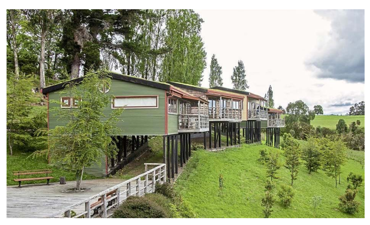
The Quilquico Hotel near Castro, an eco-friendly hotel, lodges guests in eight rooms built on stilts in the Palafitos style.

The next time, visit in autumn – March and April in the southern hemisphere – after summer vacation ends, he says. Local tourists go home and the leaves turn red and yellow. Now he tells me, I'm thinking, wondering what comes next.