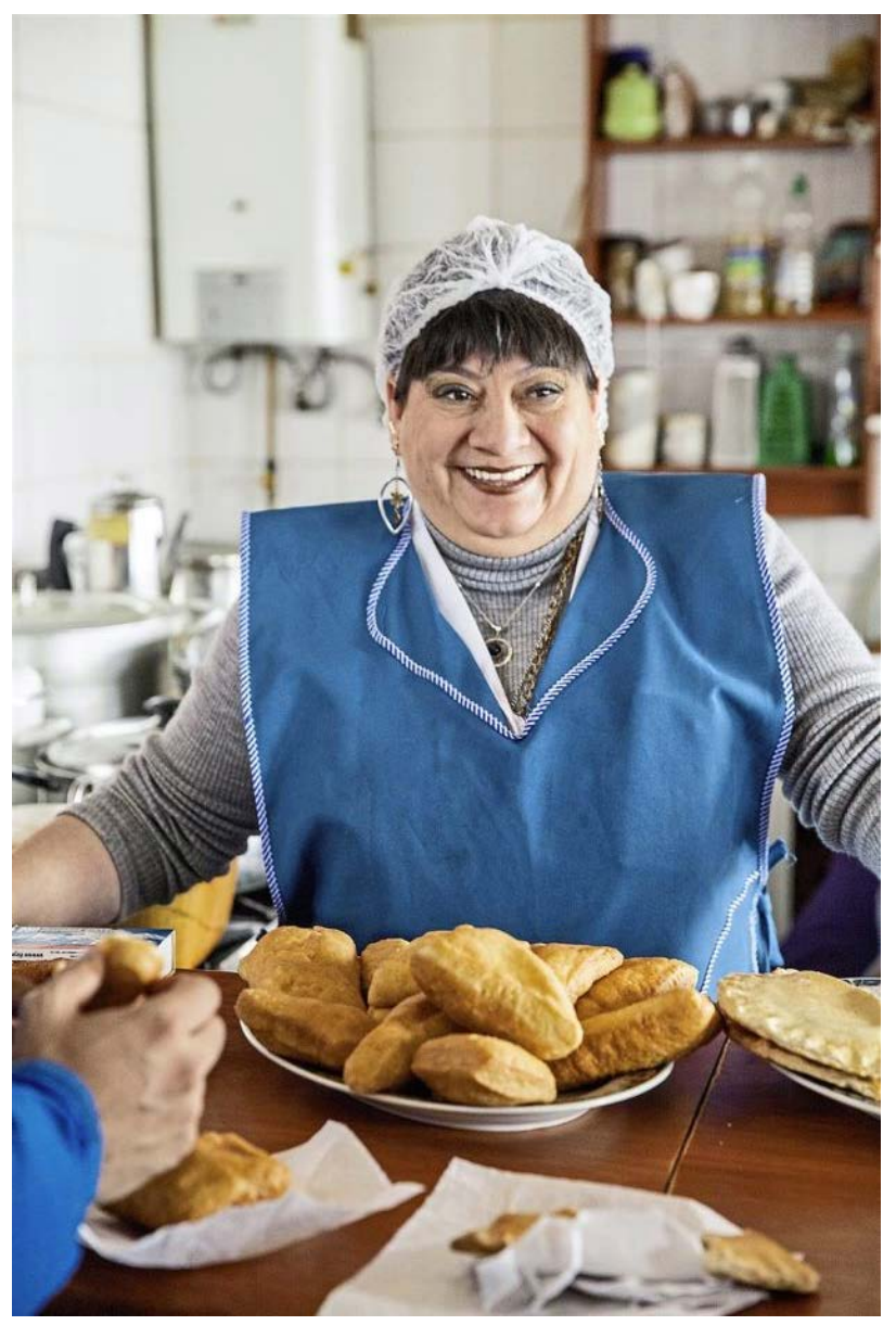
Cheerful smiles and just-baked pastries welcome visitors to the Castro

It was an accident of history, of course, that shut Chiloe off from the world. After Spain conquered Peru, the conquistadores headed south, expecting to walk over Chile's indigenous people. But the Mapuche tribes living south of the Bio Bio River weren't so easily pushed around. Whomping the Spaniards, they chased away the remaining settlers, a group of Spanish and Huilliche Indians, who fled from the mainland to Chiloe.