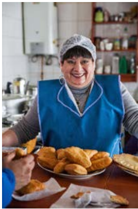
GALLERY: The verdant, inviting, eminently livable Chiloe Island off Chile