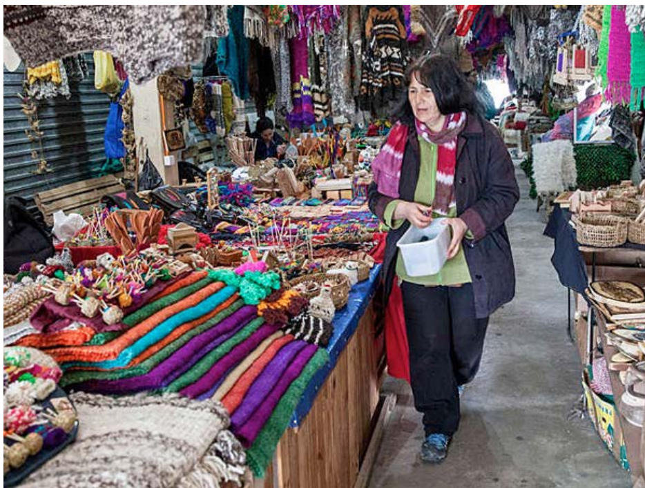
The artists' market, Feria Artesanal, in Dalcahue, on Chiloe Island, where hand-knit woolen shawls and wood carvings are for sale.

Share 22 Tweet 5 Reddit 0 Email 2 0 COMMENTS