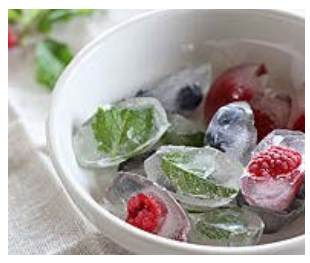
12 Ways To Make Water More Fun