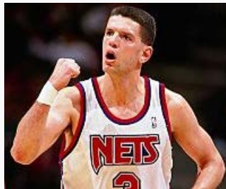
20 Athletes that Died Before Their Career Was Over Rant Sports