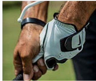
The #1 Reason the Average Golfer Can't Break 90 (or even 100)... Revolution Golf