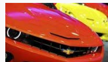
Cars recalled in 2014