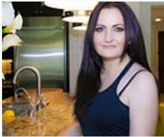
Goodbye Granite: Hot New Countertop Finishes Reviewed.com