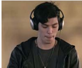
Music Mastermind: Music Made With IBM Cloud IBM