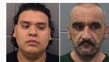
Mugs in the news