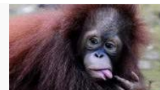
Baby animal photos