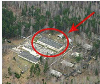
10-Million Square Foot Tech Base Revealed Money Morning