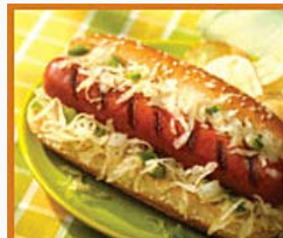
5 Hot Dogs With A Delicious Twist Hebrew National