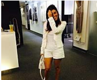
Kourtney Kardashian's Kiss With a Woman Shouldn't Come as a Surprise (VIDEO) Stirring Daily