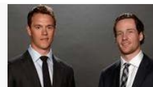
Blackhawks in suits