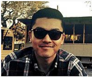
CNN Money: How Young Millionaires Invest CNN Money