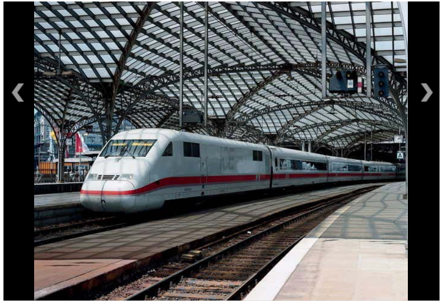
COURTESY GERMAN NATIONAL TOURIST BOARD/SPIELHOFENICE 1, the intercity-Express train, in Cologne station. HANDOUT — MCT