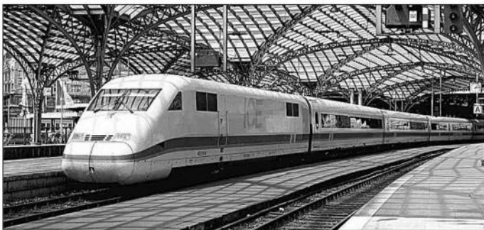
ICE 1, the Intercity-Express train, in Cologne station