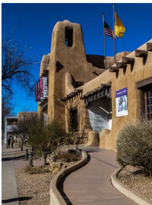
Front of the New Mexico Museum of Art, site of the Renaissance to Goya exhibit, Santa Fe, N.M.