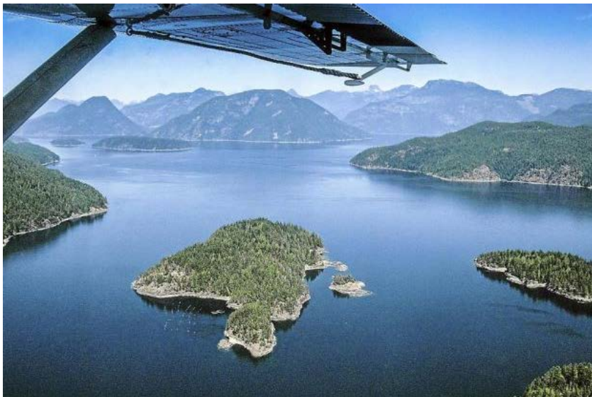
Beautiful land: CoriAir pilot and main man Mike Farrell flying low over the Discovery Islands, east of Campbell River, Vancouver Island.