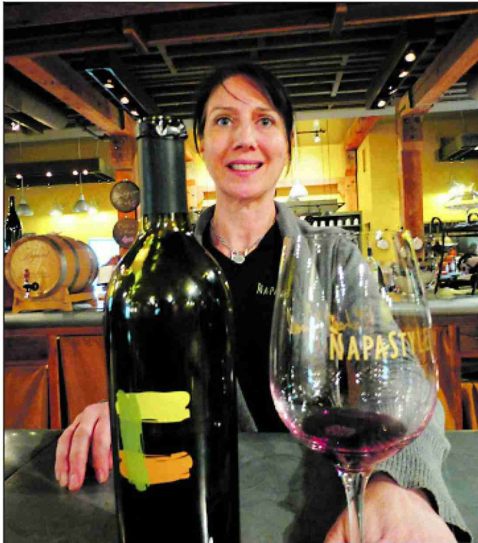
Wine samples are always popular at the Napa Style marketplace on the Vintage Estate.