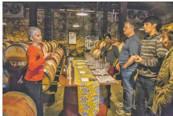
ABOVE: Guests enjoy a tasting flight at Hess Estate's cellar in California's Napa Valley.