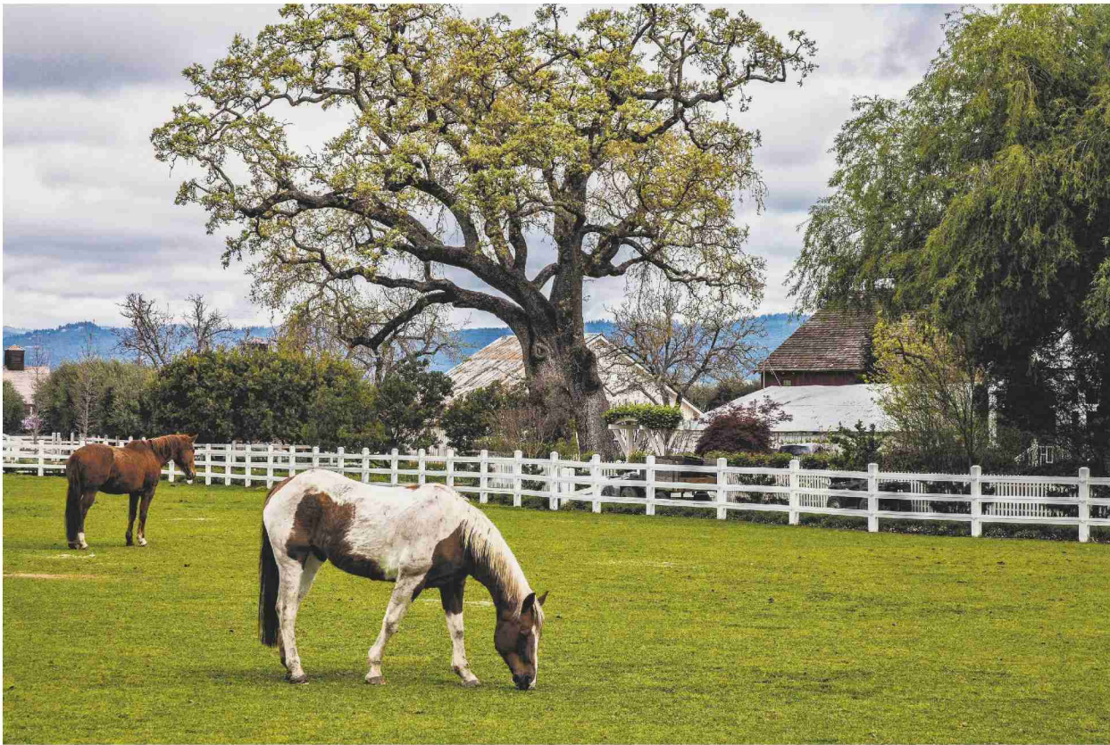
ABOVE: Classic country pastures are part of the landscape at Nickel & Nickel winery and vineyard in California's Napa Valley.

TRAVEL INFO: For more about Yountville, go to visityountville.com . For Napa Valley information, see napavalley.com .