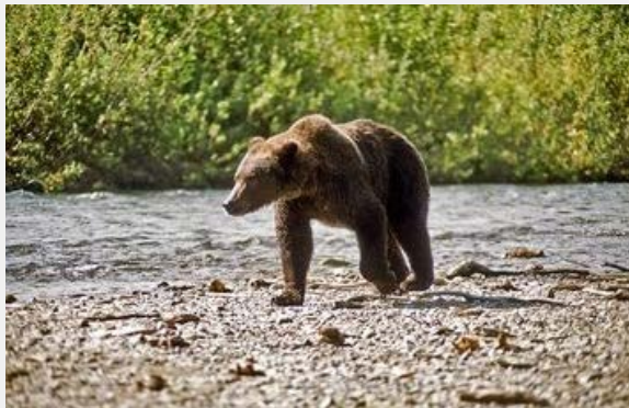
This brown bear is fishing for silver salmon along Rainbow Creek.