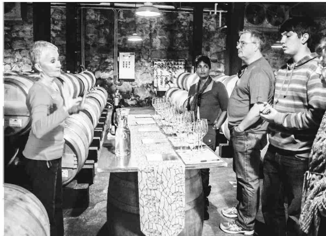
Guests enjoy a tasting flight at Hess Estate's Cellar in California's Napa Valley.