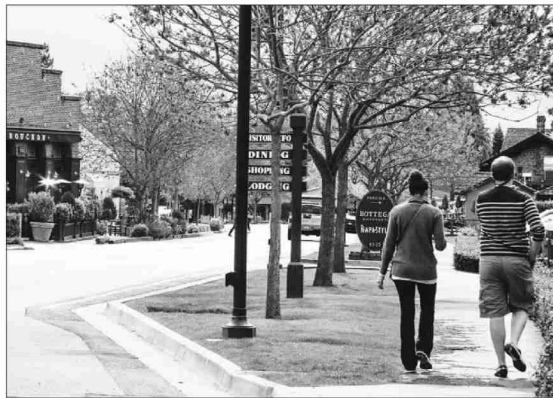
Galleries, shops and vaunted restaurants line Washington Street in Yountville.