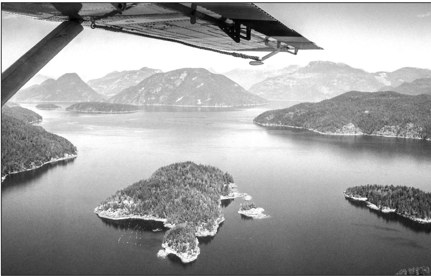
CorilAir pilot Mike Farrell flies low over the Discovery Islands, east of Campbell River, Vancouver Island, B.C.

Wandering through Nanimo we ate lunch at Troller’s Fish and Chips, a guidebook-recommended restaurant that took us 20 minutes to find, but that more than lived up to its reputation. Heading west