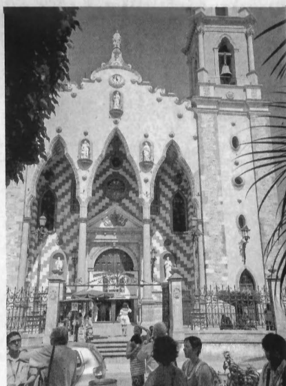
ABOVE: A cathedral in the Plaza de la Republica, in Mazatlan's historic district.