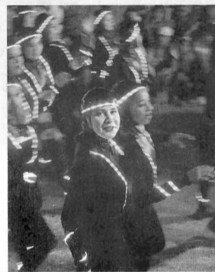
LEFT: A dance group, in alien-movie look-alike costumes, marches in the Carnaval parade in Mazatlan.