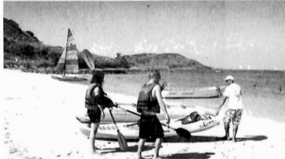
Taking kayaks into the water along Deer Island (Isla de Venados).

The cruise line industry, often the first to fold up and