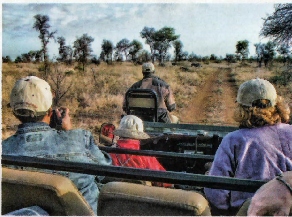
On an early-morning game drive, zebras are spotted in northern Botswana.

By 8 p.m. – or later, if you've followed a leopard drag an impala up into a tree – you'll be dragging back into camp, tired but happy, and ready for dinner.