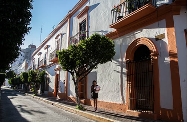
The Cal Jet flights, funded by a city and state partnership, is the answer to growing demand here for more airline seats. A core group of U.S. travelers who know Mexico — repeat visitors undeterred by often misleading reports of drug-related violence — continue to vacation here every year. Meanwhile, a new set of travelers have discovered the destination, particularly from Spain, Brazil, Peru and Russia. In 2011, tourism to all of Mexico stood at 23.7 million, of which 19.9 million were Americans. Preliminary estimates for 2012 project a hefty increase of about 2 million.