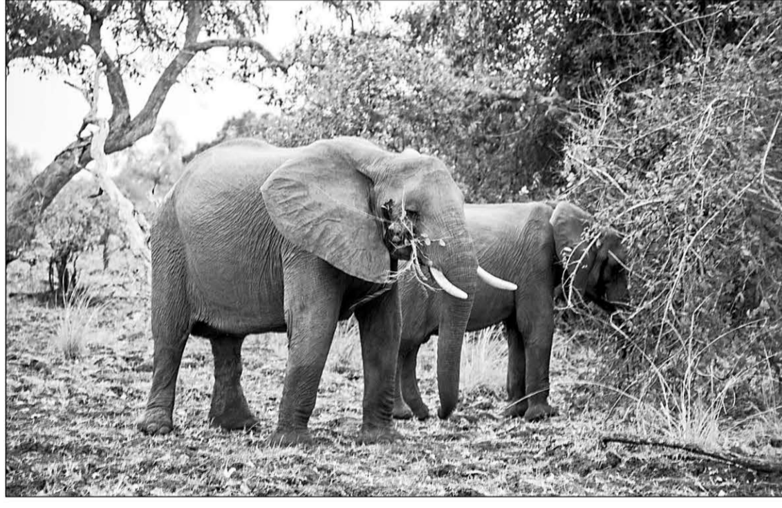
A zoom lens catches elephants unaware. A walking safari in this wildlife-rich region is new — and old. The first Europeans to venture deep into Africa expected to walk.