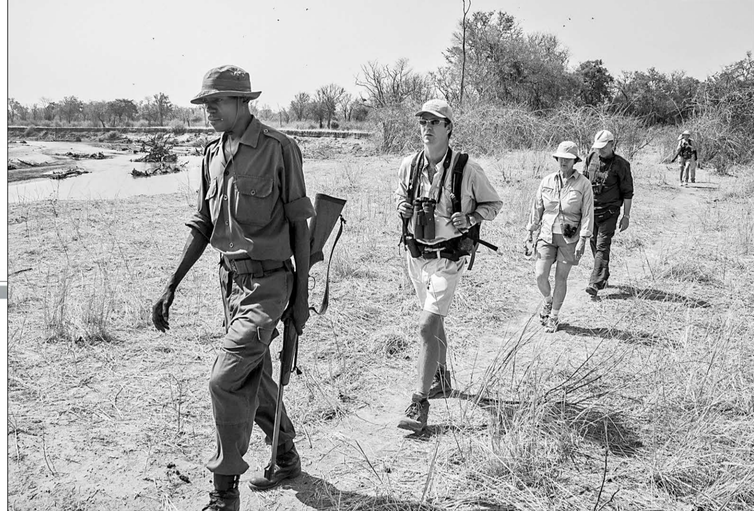
Along the Chibembe River, it's single file for safety, led by a guard, loaded rifle at the ready.