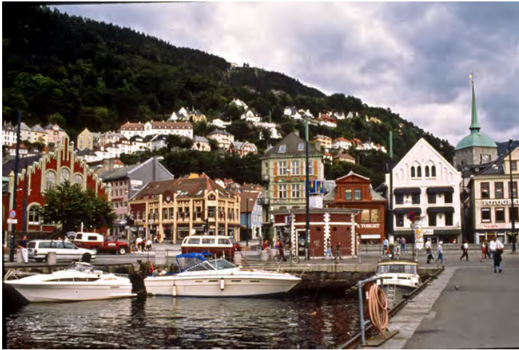
The waterfront and harbor area of downtown Bergen, Norway. Picturesque buildings festoon the mountain slopes rising from the sea.