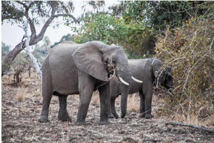
A zoomlens catches these elephants unawares.