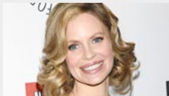
'True Blood' actress favors South Africa