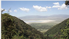
On safari in Tanzania: a 'unique, amazing place'