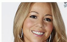
Cruise ship godmothers