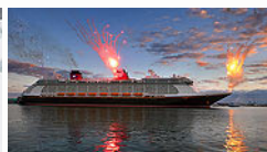
Disney Fantasy pictures