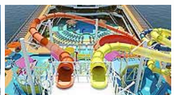
Carnival Breeze renderings