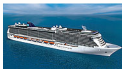
New and soon-to-arrive cruise ships

Reporters and editors involved in creating and writing these cruise articles are in no way affiliated with any links that are placed on the pages. Read our full editorial policy.