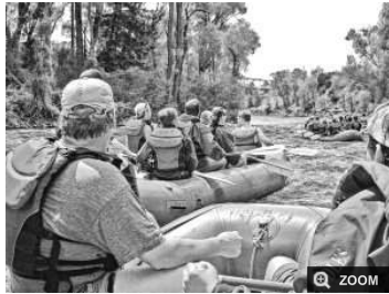
White water adventures on the Roaring Fork River, Snowmass, Colo.