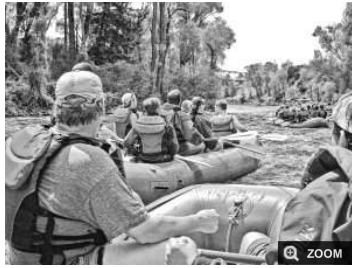
White water adventures on the Roaring Fork River, Snowmass, Colo.