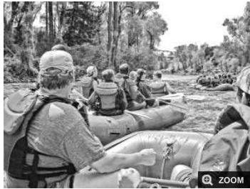
White water adventures on the Roaring Fork River, Snowmass, Colo.