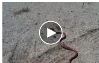
Gopher snake found in Palm Desert released Jun. 27, 2012