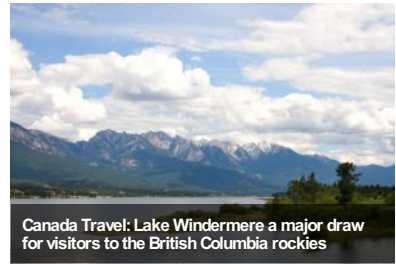
Canada Travel: Lake Windermere a major draw for visitors to the British Columbia Rockies

Entrepreneurs behind Toronto's CitySeed set on SXSW to finish iterative development of their restaurant app