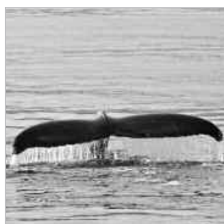
A whale tail surfaces near the Sea Bird in Frederick Sound.