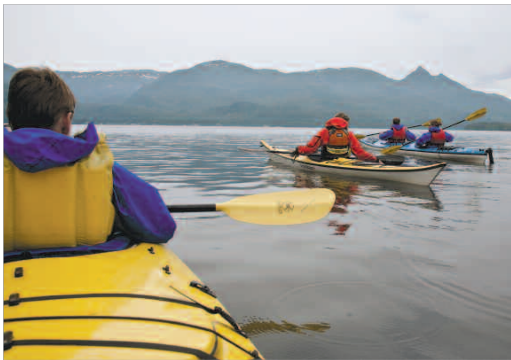
Kayakers explore the coves in the Tongass Narrows, Ketchikan. Lindblad cruises include ship-based excursions and the use of kayaks and weather gear.

Small-ship cruising gives a more intimate view of Alaska's Inside Passage