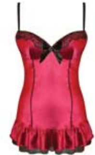
Mother's Day Hot Lingerie & Sleepwear Gifts – Mother's Day Lingerie & Sleepwear Gift Guide 2011