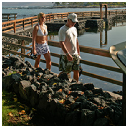
Hotel guests follow the boardwalk trail across the fish ponds, at the Mauna Lani Bay Resort.

If you wander along the beach toward the south, beyond the lobby lounge and the hotel's three restaurants, past the inviting open-air bar and the swimming pool, you'll discover 1,800 acres of the original site, now a historic park and preserve, mostly on private property, where archaeologists have unearthed artifacts dating back to 1200 A.D.