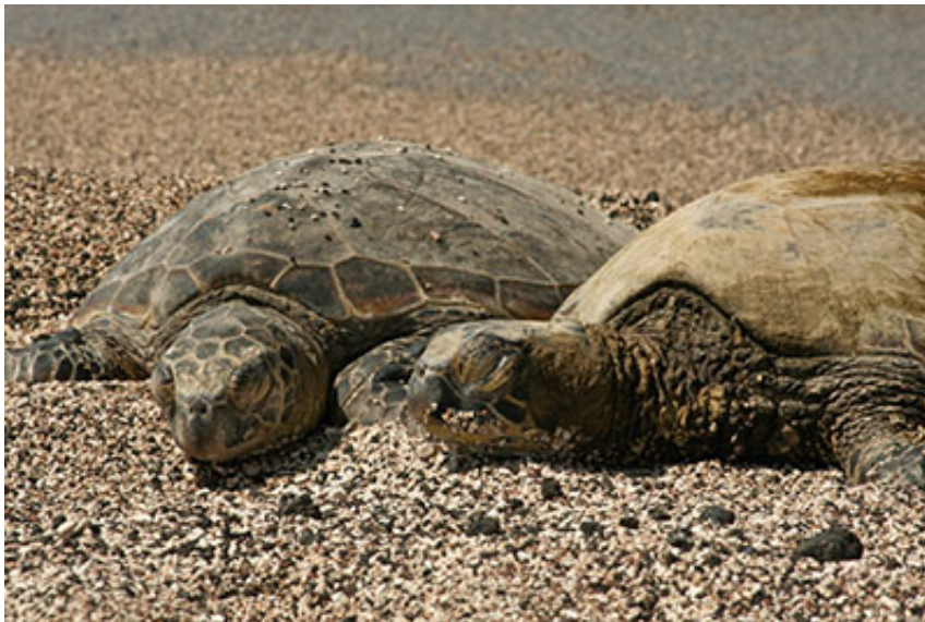
Resident green turtles bask on a quiet corner of the Mauna Lani Resort beach.

Along the way a fork in the trail passes 15 acres of spring-fed ponds which the Hawaiians depended on for drinking and cooking, and the salt-water lagoons in which they raised and harvested local fish. Another fork turns inland to a dense flow of lava and a group of shelter caves and tool-making sites.