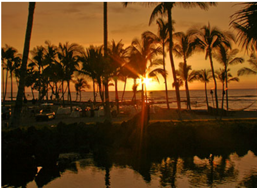
South Pacific sunsets are among the world's most spectacular.

HAWAII – In the five centuries before the first British ship arrived in the Hawaiian Islands, the Big Island 's royal family – the “ali” – treasured the spectacular coastal site that they called Kalahuipua’a ,” on what is now known as Mauna Lani Bay .