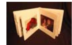
Mother's Day Family Gifts – Mother's Day Family Gift Guide 2011