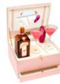
Mother's Day Food & Beverage Gifts – Mother's Day Food & Beverage Gift Guide 2011 Over $15