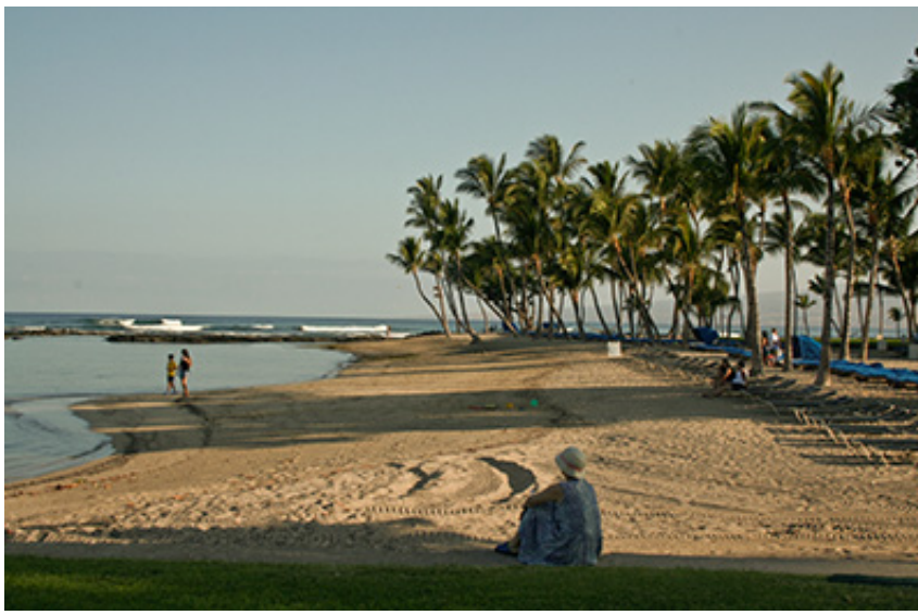
Early morning on the beach at the Mauna Lani Bay Hotel & Resort.

FAST FACTS: Guests of the Mauna Lani Bay Hotel & Bungalows have direct access to the trails that start near the hotel. But there is no public parking at the hotel. Non-hotel visitors can park in a public lot off the highway, south of the hotel, where signs indicate the Historic Access Trail. It's a half-mile walk from this point to the beach.