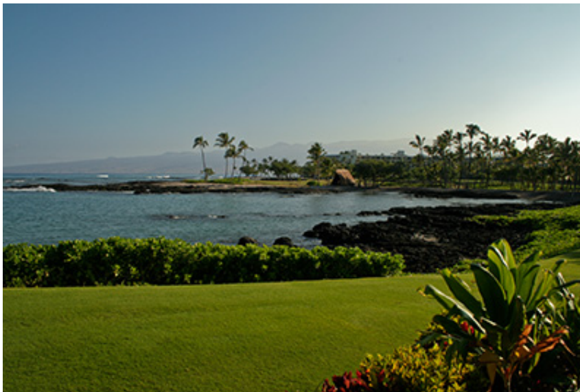
The beaches and ponds at Mauna Lani Bay are protected from ocean

FAST FACTS: Guests of the Mauna Lani Bay Hotel & Bungalows have direct access to the trails that start near the hotel. But there is no public parking at the hotel. Non-hotel visitors can park in a public lot off the highway, south of the hotel, where signs indicate the Historic Access Trail. It's a half-mile walk from this point to the beach.