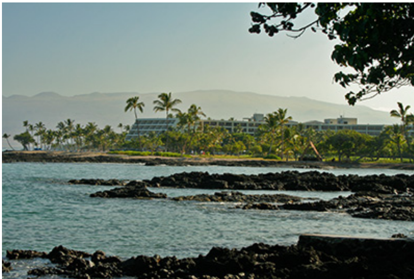
The Mauna Lani Bay Hotel hugs the high ground on the north side of the

HAWAII – In the five centuries before the first British ship arrived in the Hawaiian Islands, the Big Island 's royal family – the “ali” – treasured the spectacular coastal site that they called Kalahuipua’a ,” on what is now known as Mauna Lani Bay .