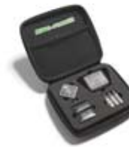
Mother's Day Vehicle Gifts – Mother's Day Vehicle Gift Guide