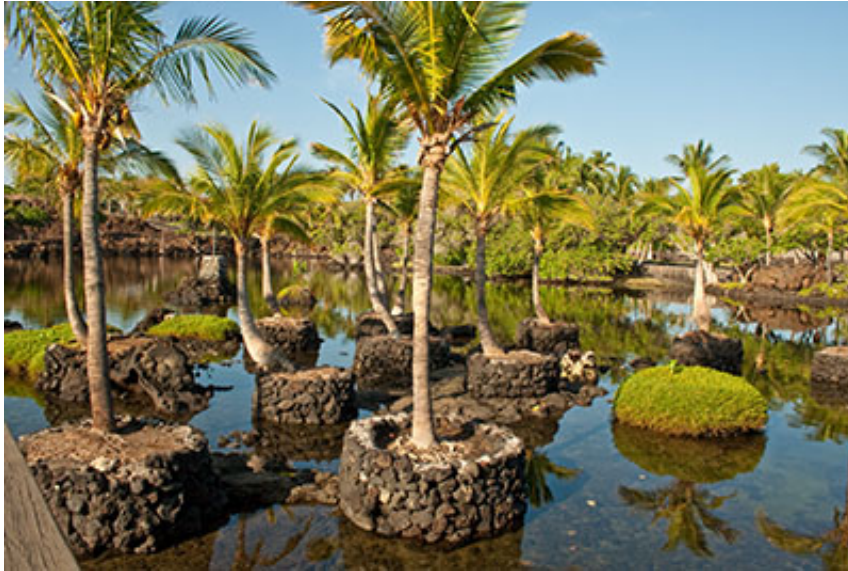
Fresh-water springs and tidal in-flows fill these ancient fish ponds.

A rich menu of natural resources – the bay’s white sand beaches, hidden caves, groves of palms, fresh-water springs and lava-rock pools – made the site an ideal place to build a series of interconnected fish ponds, the primary source of protein in the Hawaiians’ daily diet. Convenient for a temporary settlement, it also provided a cool spot for a summer retreat.