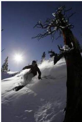
A skier enjoys the powder on Oly Bowl in Aspen Highlands. (ASPEN SNOWMASS)

SNOWMASS, Colo. -- As the hours pass and the grape begins to flow, the talk turns to snow, a skier's only essential element. We can manage without the usual resort conveniences: on-mountain dining, trail maps, maybe even the chairlifts. Without snow, preferably fresh powder, we'd be nowhere.