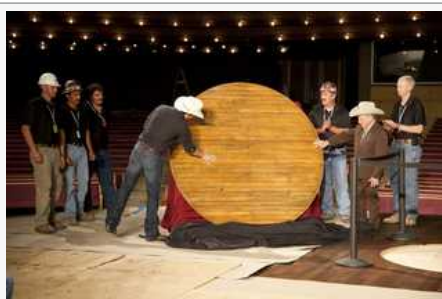
Grand Ole Opry members Brad Paisley and Jimmy Dickens unveil the famed circle of wood at the Grand Ole Opry House shortly before returning it to center stage last month.

Music City has made a remarkable comeback since last May's deluge – and the Grand Ole Opry didn't miss a beat.