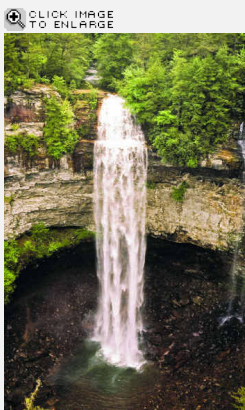
One of the highest waterfalls east of the Rockies, the main falls drop 256 feet into a deep gorge.