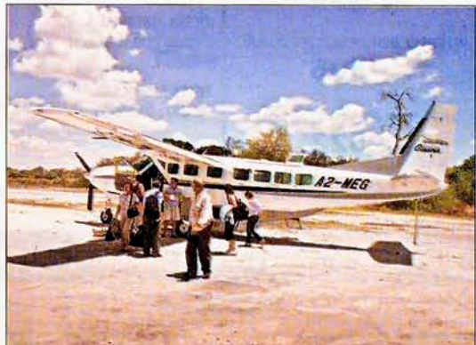
An African safari often means taking several flights on small planes. Light aircraft has weight and space restrictions, so be prepared to pack your belongings in a soft-sided duffel bag.