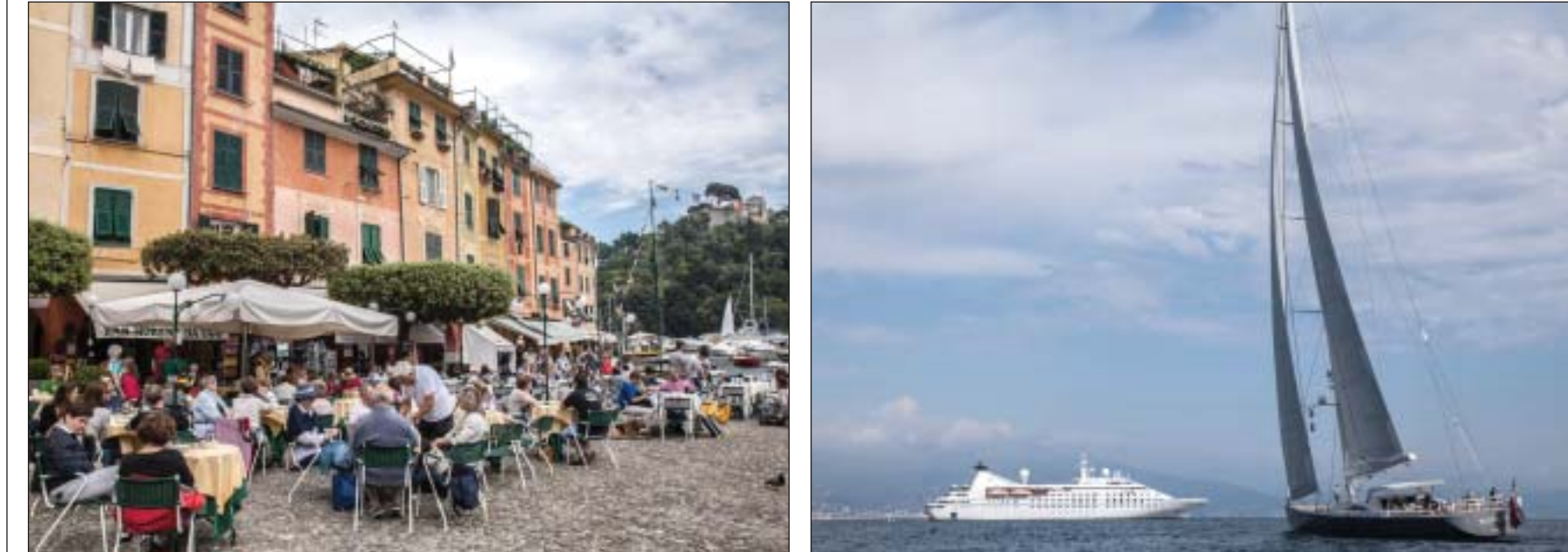
Left: Visitors absorb the best of "La dolce vita" at the harbor on Portofino, Italy. Right: The cruising yacht Star Breeze and the British-flagged sailing yacht Eureka share the sea off Portofino, Italy.