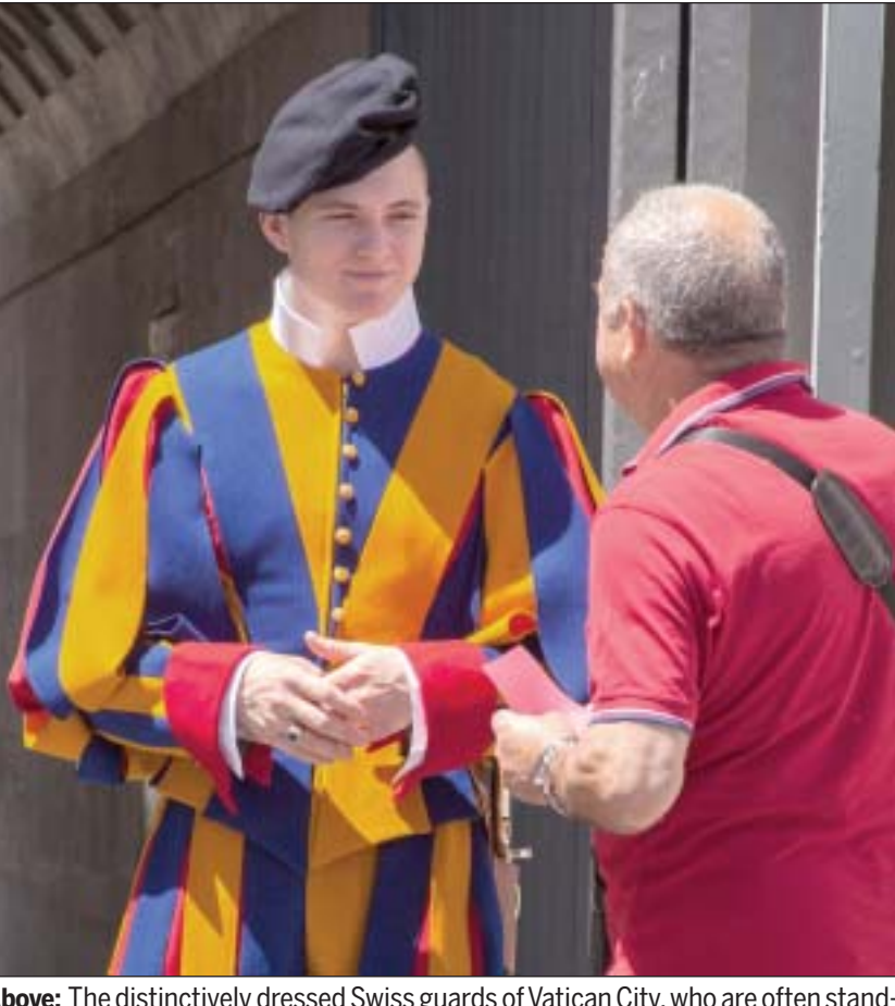
Above: The distinctively dressed Swiss guards of Vatican City, who are often standing at attention, also assist tourists who ask for help. Below: Raphael, the artist who painted the fresco 'The School of Athens,' included this self-portrait in the work. He is the man in the black hat looking out of the painting.