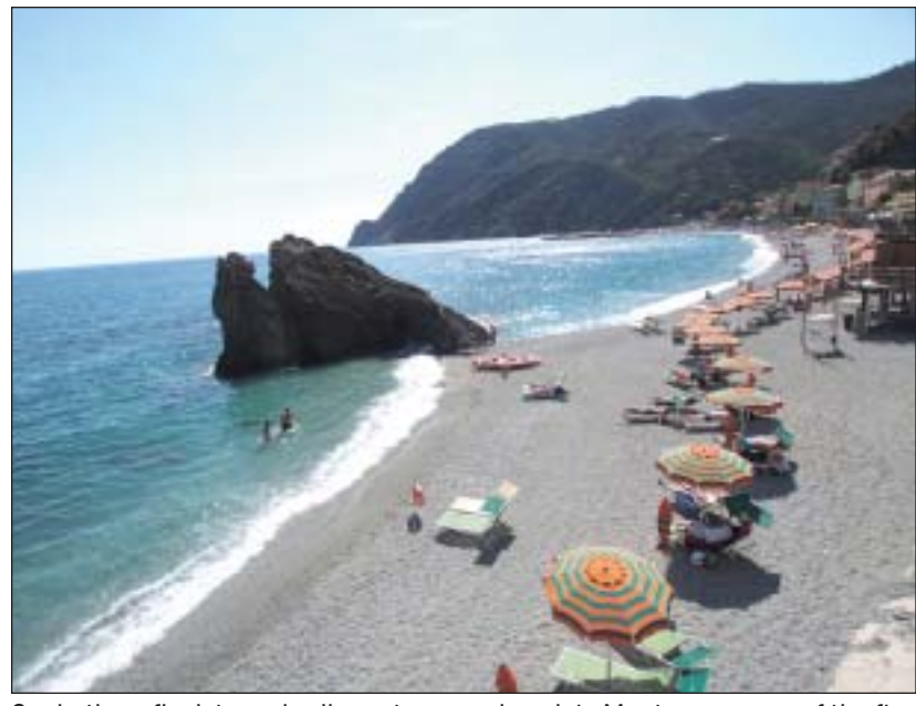
Sunbathers flock to umbrellas set up on a beach in Monterosso, one of the five small cliffside villages in Cinque Terre.