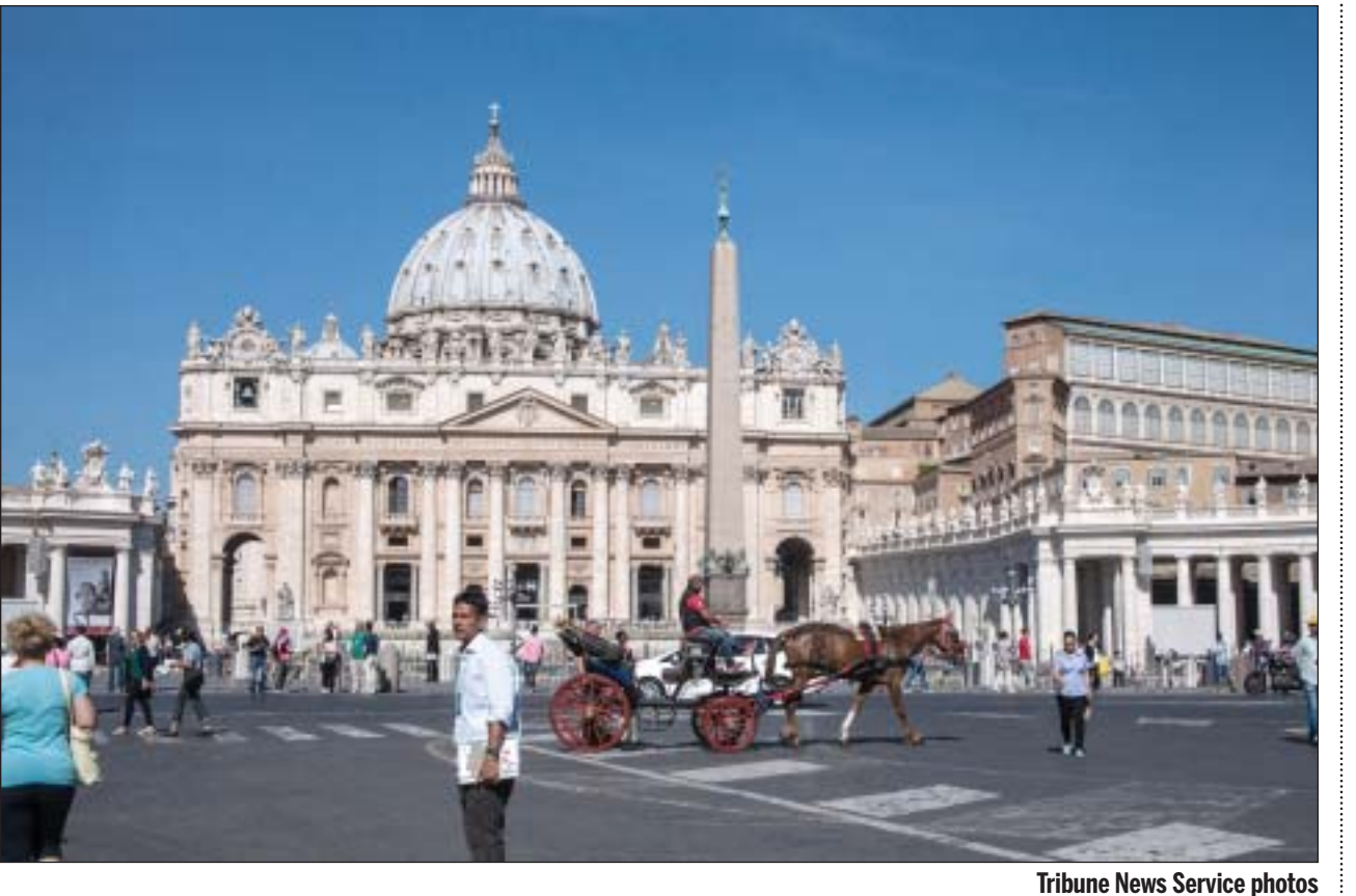
The early-morning crowd at St. Peter's Cathedral isn't as dense as it gets later in the day.