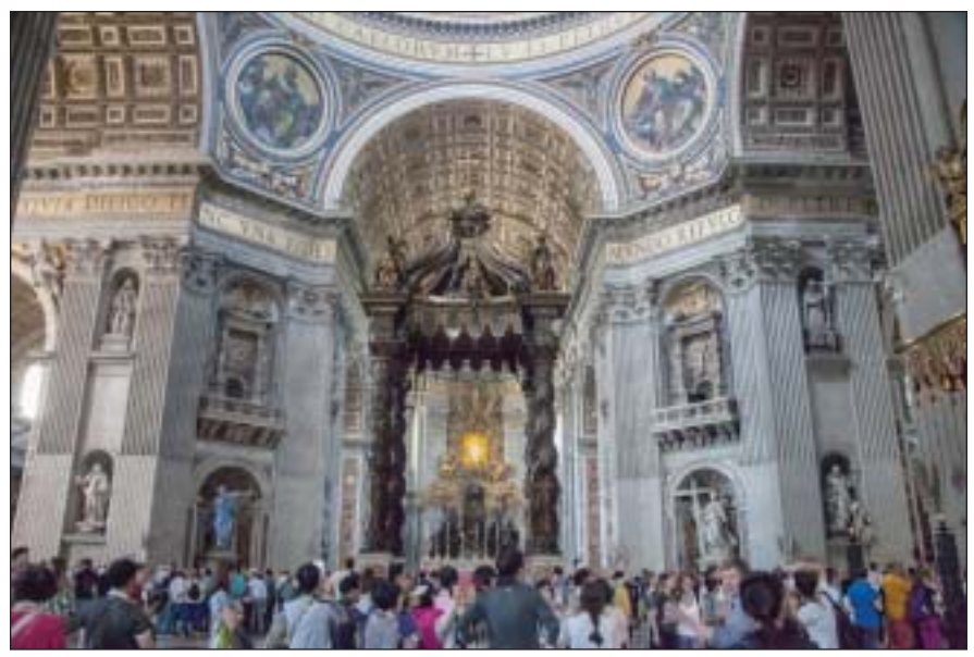
Crowds in St. Peter's Cathedral in Rome push up to the railing in front of the Baldachin and main altar.

That means jostling crowds, straggling groups and massive lines. But flash your Omnia & Roma Pass and you're through the gate and into the Coliseum, where gladiators really did bludgeon each other to death. Or into the Vatican rooms, once palatial living